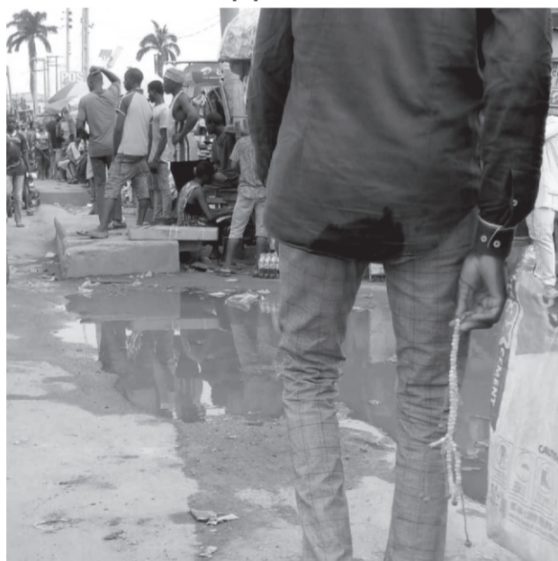
Anuoluwapo Plank Market entrance

"This is not the first time we would be complaining about