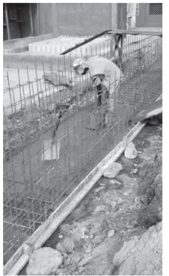
Ongoing drainage at Old Ewu road

She believed that with the intervention concerning drainage and road rehabilitation, the perennial flood which has been ravaging the community would be solved.