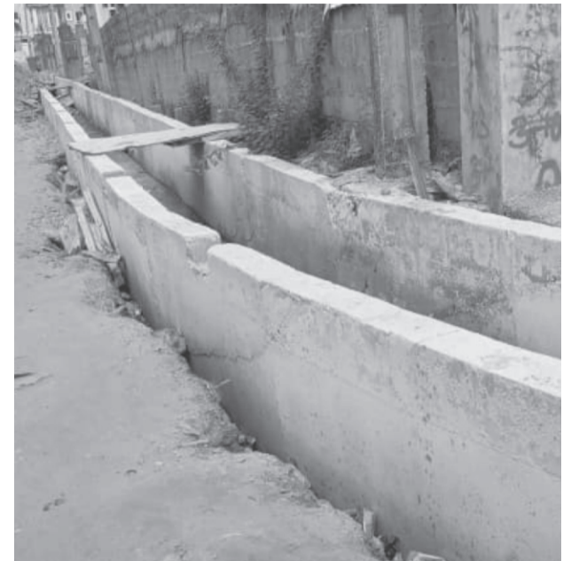
Greenfield community drainage

He said all the zones are faced with the same challenge of drainage which has been the major project in the ward.