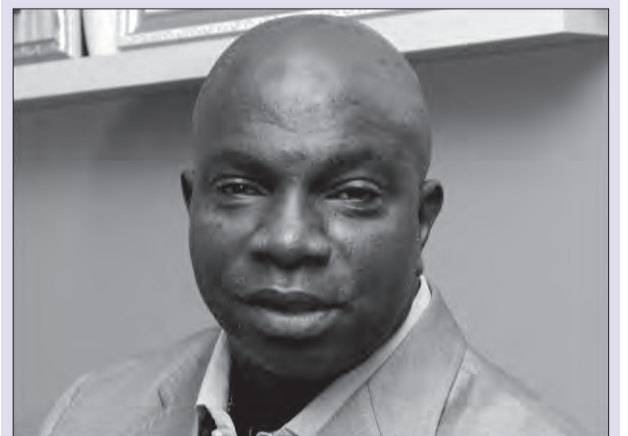
Hon. Shamsudeen Olaleye