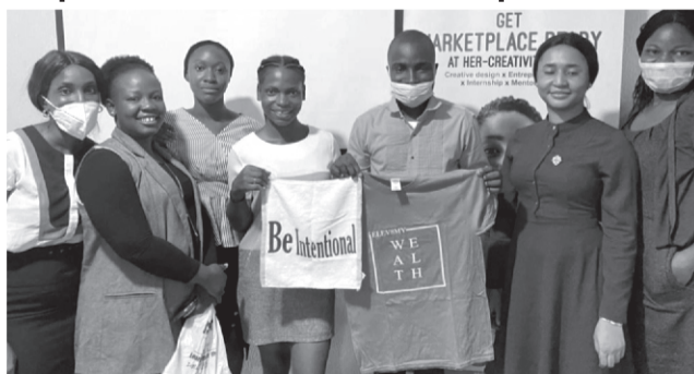
Some of the participants in a group photograph

Another participant, Eseghe Eburu said the training was